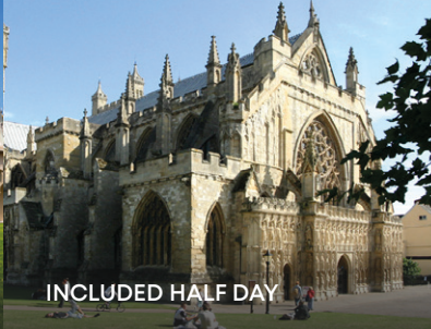
INCLUDED HALF DAY

This excursion is approximately 5 hours of which up to 1 hour is travel time.