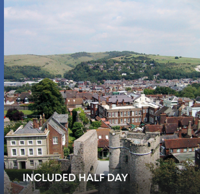
INCLUDED HALF DAY

3 & 4 week students only. This excursion is approximately 5 hours of which up to 1 hours is travel time.