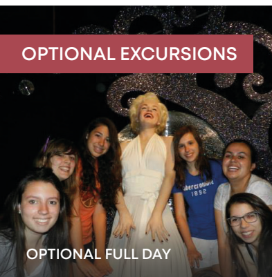
OPTIONAL FULL DAY