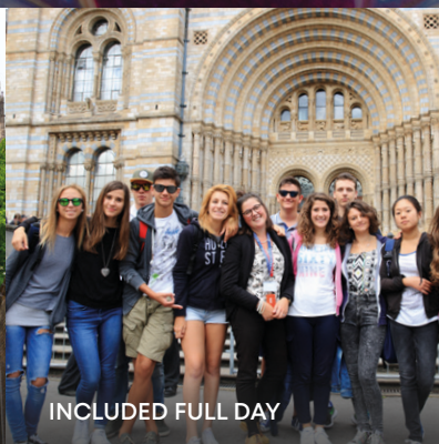
INCLUDED FULL DAY

Packed meal included. This excursion is approximately 9 hours of which up to 3.5 hours is travel time.