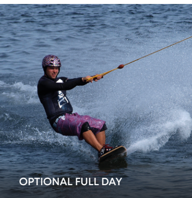
OPTIONAL FULL DAY

Packed meal included. This excursion is approximately 9 hours of which up to 3 hours is travel time.