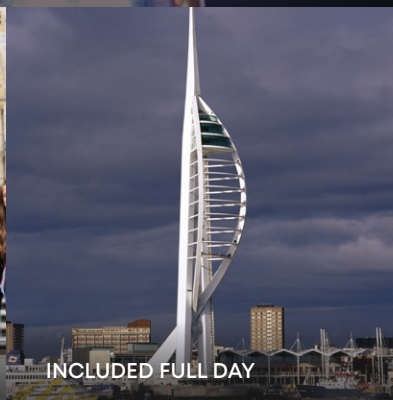
INCLUDED FULL DAY

Included for long-stay students/optional paid excursion on Thursdays for a fee of GBP 27. This excursion is approximately 9 hours of which up to 3 hours is travel time.