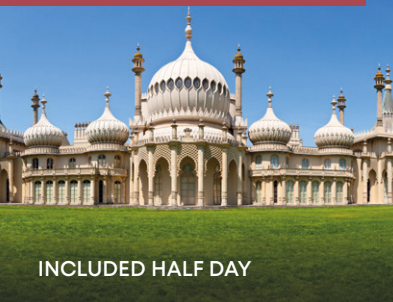
INCLUDED HALF DAY