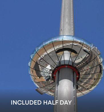
INCLUDED HALF DAY

This excursion is approximately 5 hours of which up to 2 hours is travel time.