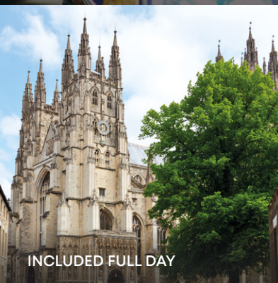
INCLUDED FULL DAY