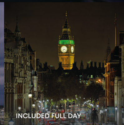
INCLUDED FULL DAY

Packed meal included. This excursion is approximately 9 hours of which up to 4 hours is travel time. This trip is for 3 and 4 week students only.