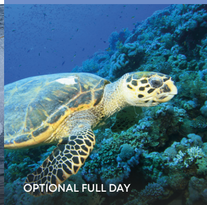
OPTIONAL FULL DAY

Packed meal included. This excursion is approximately 4 hours of which up to 1 hour is travel time.