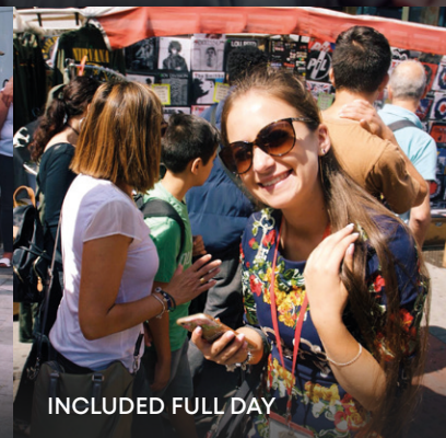
INCLUDED FULL DAY