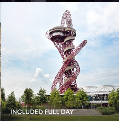
INCLUDED FULL DAY