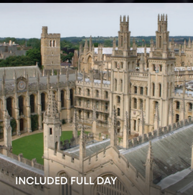
INCLUDED FULL DAY