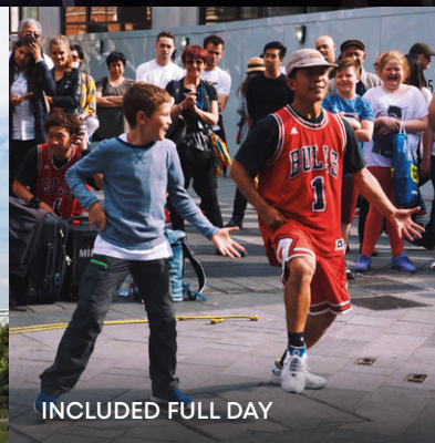
INCLUDED FULL DAY