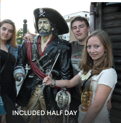
INCLUDED HALF DAY

Admission is included. The total duration of this trip is 4.5 hours. 1 hour of this is travel time.