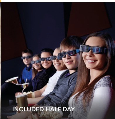
INCLUDED HALF DAY