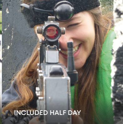
INCLUDED HALF DAY