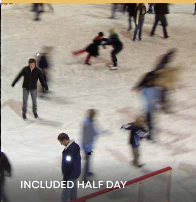
INCLUDED HALF DAY