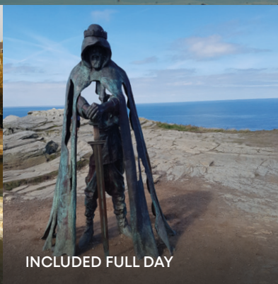
INCLUDED FULL DAY

The total duration of this trip is 9.5 hours. 5 hours of this is travel time.