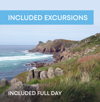
INCLUDED FULL DAY