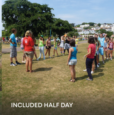
INCLUDED HALF DAY