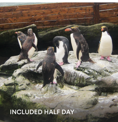
INCLUDED HALF DAY

Admission to Paignton Zoo is included. The total duration of this trip is 4.5 hours, 30 minutes of this is travel time.