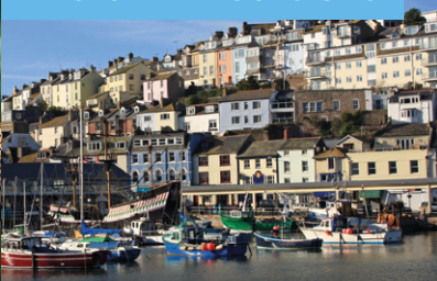
INCLUDED HALF DAY