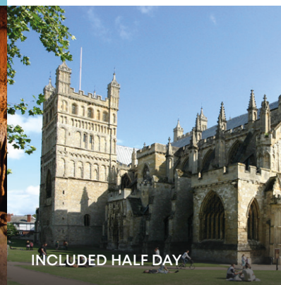
INCLUDED HALF DAY