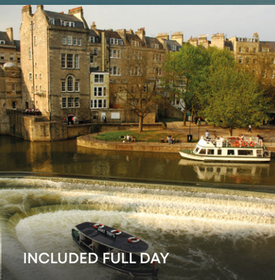
INCLUDED FULL DAY