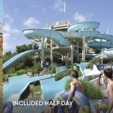
INCLUDED HALF DAY