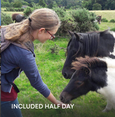
INCLUDED HALF DAY