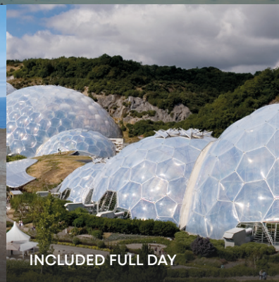
INCLUDED FULL DAY

The total duration of this trip is 8.5 hours.