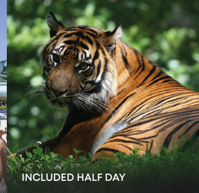
INCLUDED HALF DAY