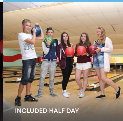
INCLUDED HALF DAY