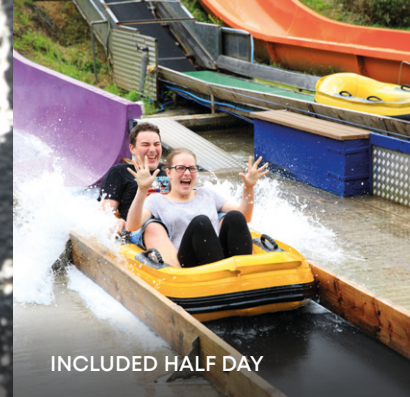
INCLUDED HALF DAY