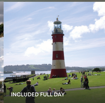
INCLUDED FULL DAY

Small groups only. The total duration of this trip is 8 hours. 4.5 hours of this is travel time with two stop breaks.