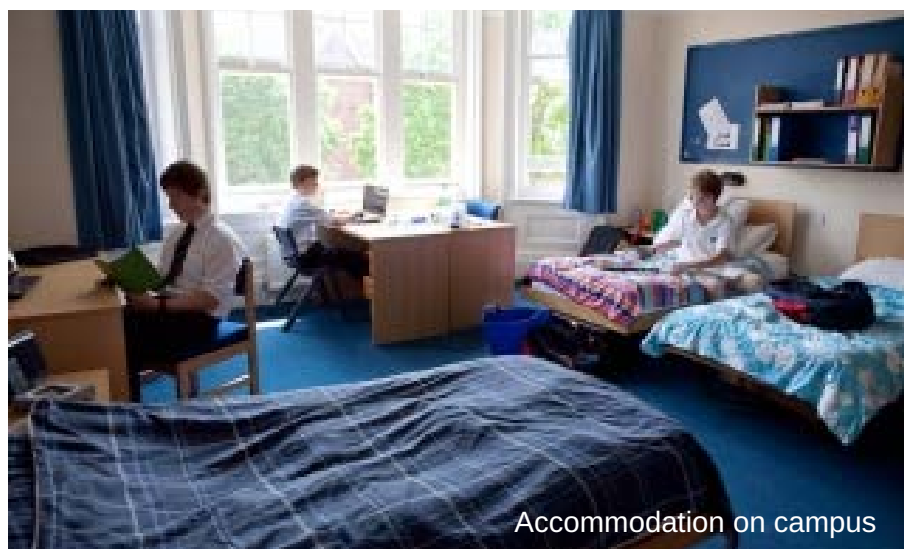
Accommodation on campus

Accommodation is in ten houses located throughout the campus. All are close together and none are more than a few minutes' walk from all facilities. The plan above gives you an introduction to this layout.