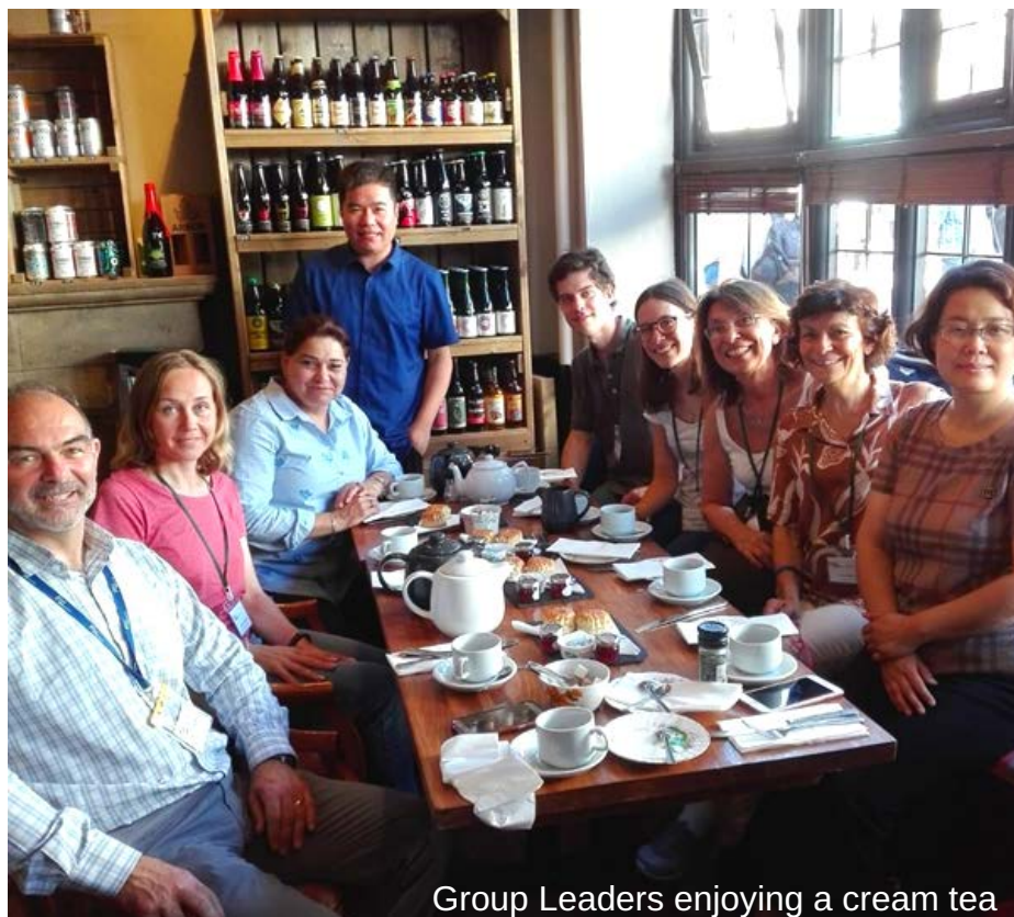
Group Leaders enjoying a cream tea

Elac has a dedicated office and its location will be given out when students arrive. There is also a Group Leaders room on-site where Group Leaders can relax and have access to tea and coffee.