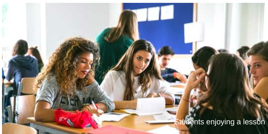
Students enjoying a lesson

Younger students may have the opportunity to participate in a Trinity Stars Performance. There is an additional charge for this (please see our website).